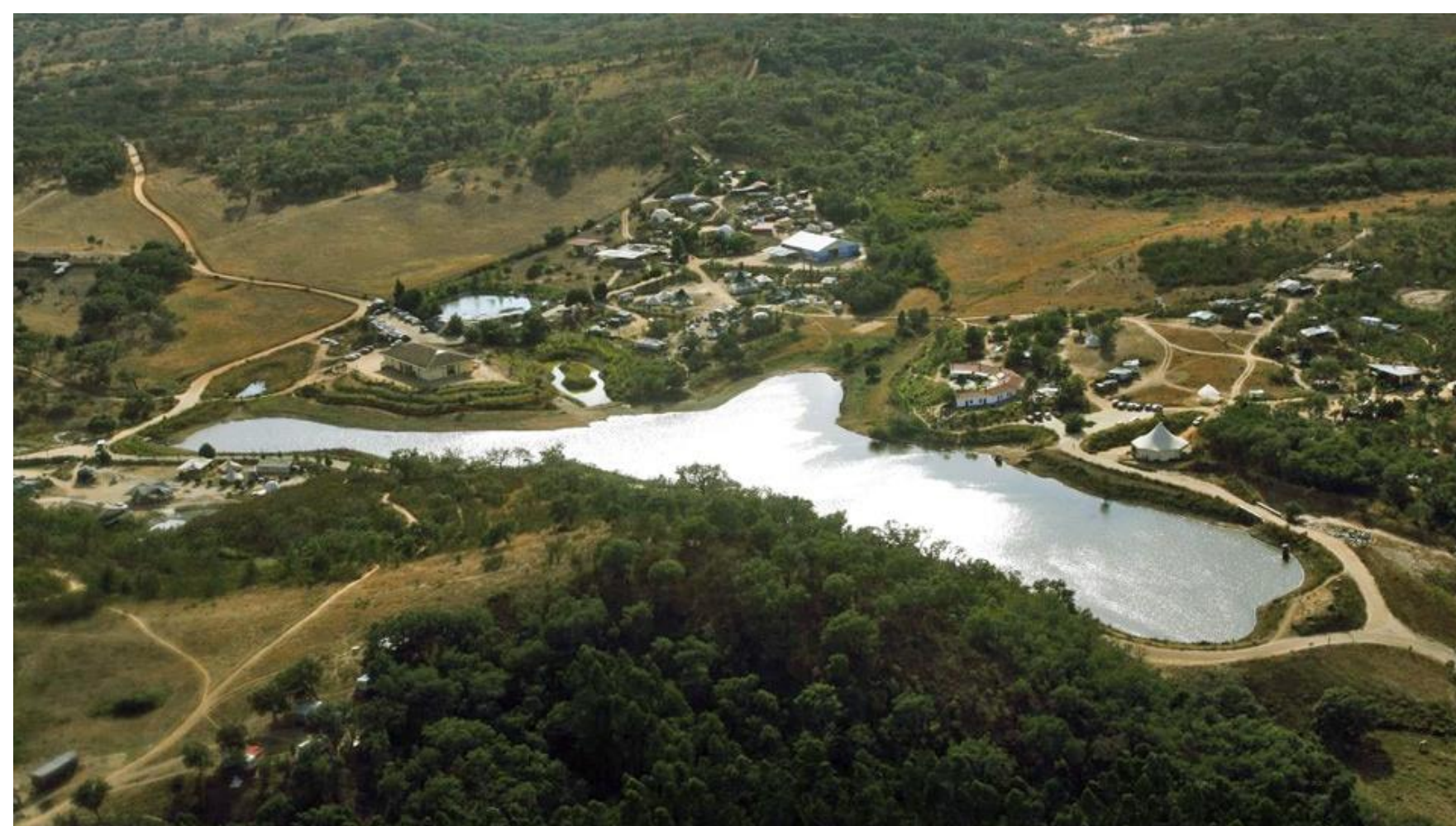
Figures - Water Retention Landscape of Tamera in 2013, Tamera, Alentejo, Portugal

Tamera, a farm of 154 ha, is located in the most arid region of Portugal (Alentejo). The creation of a water retention landscape had the goal of counteract the increasing trends of erosion, desertification and droughts observed in the area. This in turn allows Tamera to become self-sufficient in terms of water and food and to reduce its vulnerability to climate change and water-related extreme events such as droughts, water scarcity and floods. This approach to water management has created a regenerative basis for autonomous water supply, the regeneration of topsoil, forest, pasture and food production, and greater diversity of wild species. Another goal is to use Tamera example to demonstrate a model that can be implemented in other Mediterranean areas prone to desertification.